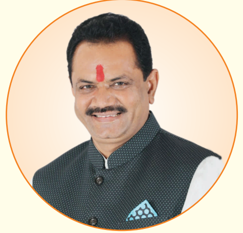
Shri Jitubhai Vaghani Hon'ble Minister of Education, Gujarat