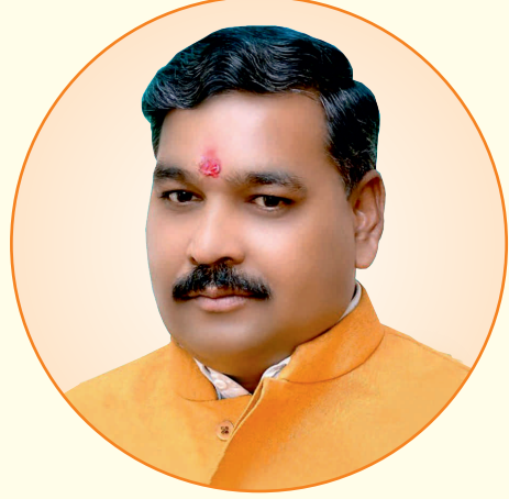
Dr. Kuberbhai Dindor Hon'ble Minister of State, Higher and Primary Education, Gujarat