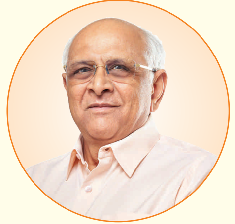
Shri Bhupendra Patel Chief Minister, Government of Gujarat